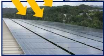
Solar photovoltaic module: Kyocera 250W x 600