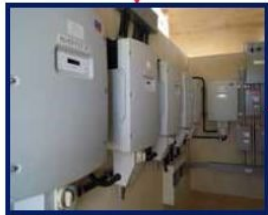
Inverter: 10kW x 15 Monitoring System