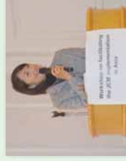
Welcome Speech by Ms. Tamayo Marukawa, Minister of the Environment, Japan