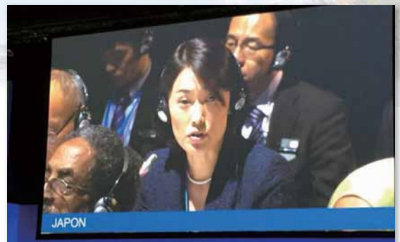
Ms. Marukawa, Minister of the Environment, Japan making a statement in the Comité de Paris at COP21.

The amount of emission reductions and removals acquired by Japan under the JCM will be appropriately counted as Japan's reduction in accordance with the Paris Agreement. Japan is going to contribute to the development of the guidance for robust accounting including for avoidance of double counting to be adopted by the Conference of the Parties serving as the meeting of the Parties to the Paris Agreement (CMA).