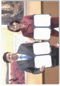
Signing ceremony in Tokyo