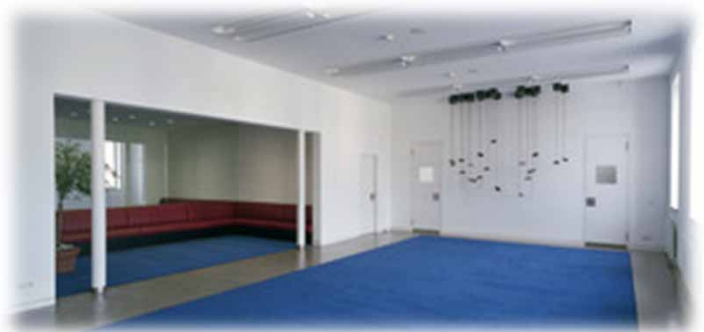
The seminar venue: Lounge, the Art and Exhibition Hall

Catering will be served for further exchange of views among the participants after the event.